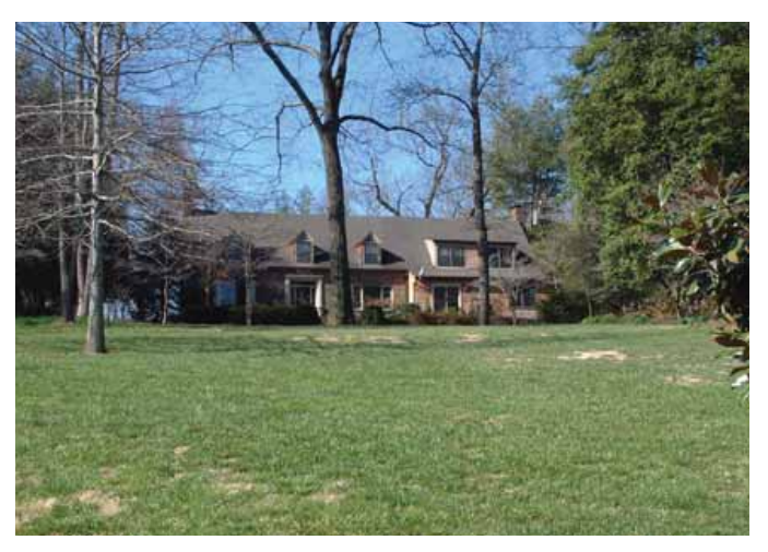
1111 Scenic Drive

Tudor Revival (1940). One and one-half story Crab Orchard stone building. Side gable roof with lower side gable roof on wings on north and slate shingle roof covering, shed roof dormers on front elevation. Eight over eight double hung windows. Recent addition on south elevation. Interior central brick chimney. Designed by Francis Keally, who also designed the Brooklyn Public Library, the Oregon State Capitol, the Iranian Embassy in Washington, D.C., the 1939 World's