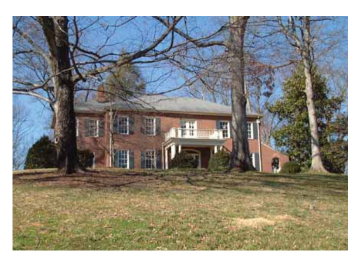
1003 Scenic Drive

Neoclassical (1930). Two story frame with brick veneer wall covering and one story ells on north and south elevations. End gable roof with slate roof covering. Two story flat roof gable front porch with sawn wood chinoserie railing, square wood columns with Doric capitals. Central front entry with wood