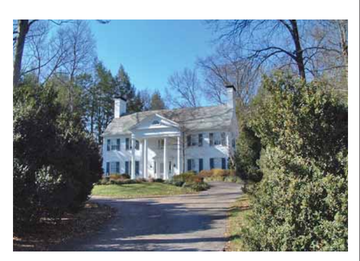
1065 Scenic Drive

Art Moderne (1935). Two story frame with stucco wall covering. Flat roof atop corbelled cornice. Paired eight over eight and one over one double hung and casement windows. Central front entry stoop flanked by curved