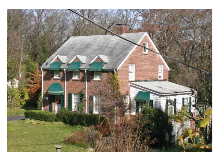
538 Scenic Drive

six double hung windows, paired on façade. Exterior front brick chimney. Brick foundation. Irregular plan. (C)