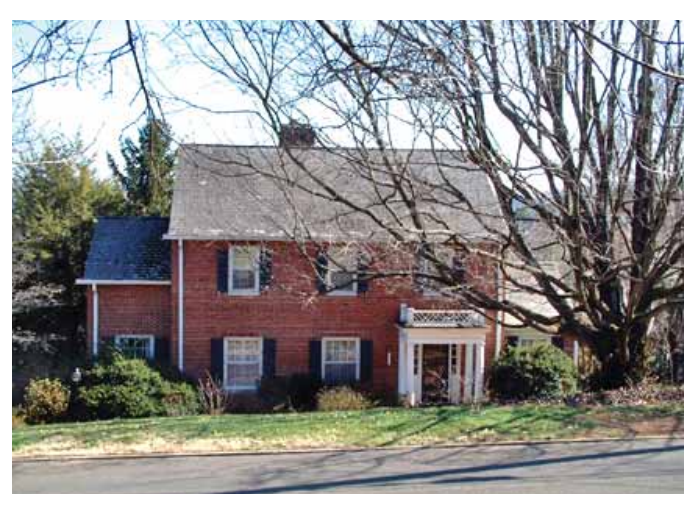
1018 Scenic Drive

1040 Scenic Drive (121DD005). Ranch (1952). One story frame with brick veneer wall covering. Hip