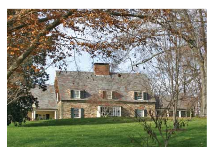
1119 Scenic Drive

Fair Communication Building and the American Cemetery in Luxembourg. Interior basement room is a copy of the Ipswich Room in the Metropolitan Museum of art in New York. (C)