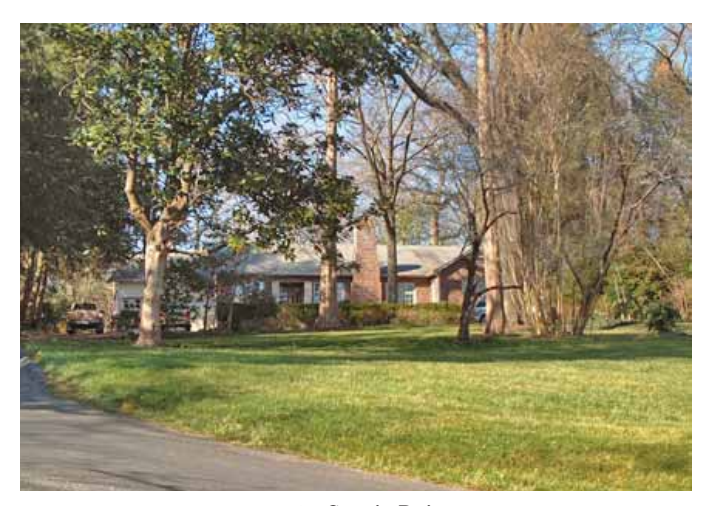
1105 Scenic Drive