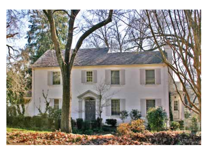
942 Scenic Drive

Contemporary (1981). Two story block construction with stuccoed wall covering. Projecting front central porte cochere with oriental influence in roof braces. Intersecting gable roof with shingle roof covering. End brick chimneys. Y-shaped plan. Rear of house in mid-century modern styling with extensive glazing facing Bluff View Drive. Temporary home of Charles Frazier, Commissioner of the 1982 World's Fair. (NC)