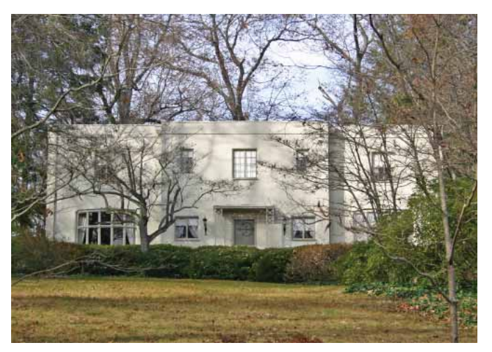
1079 Scenic Drive

Neoeclectic with Tudor influence. (1948). One story frame with brick veneer wall covering. Side gable roof with shed and gabled dormers on facade and composite