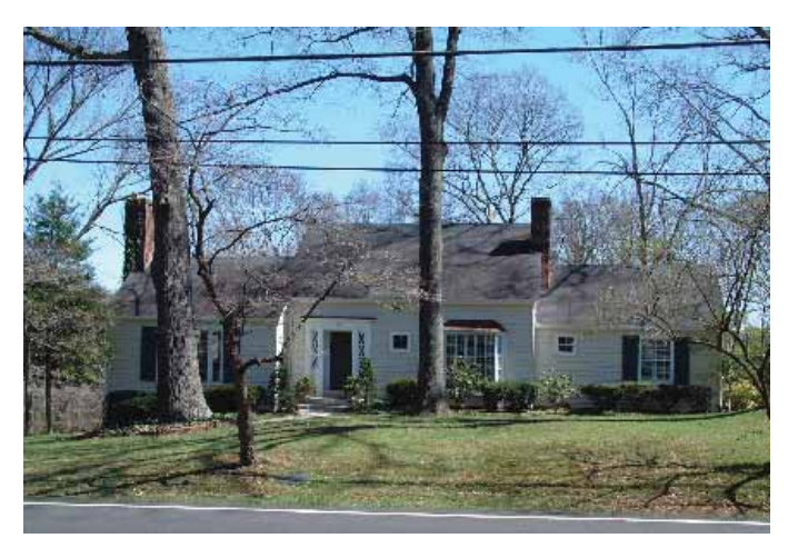
438 Scenic Drive