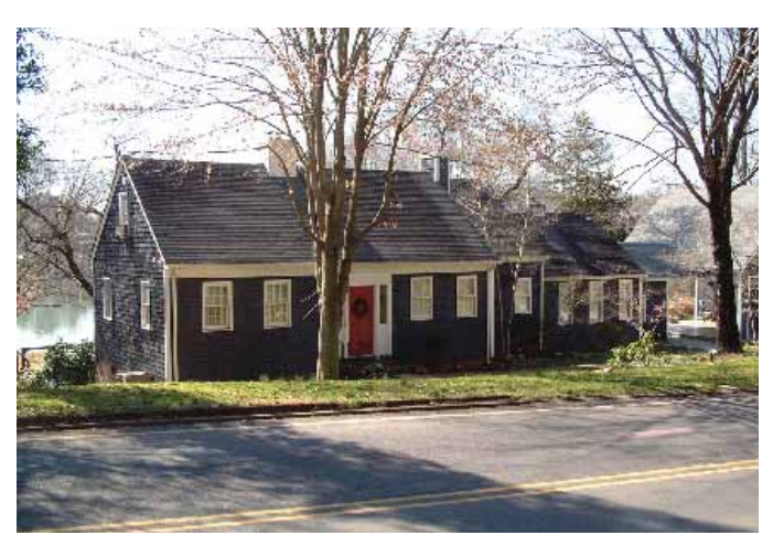
805 Blows Ferry Road

Neoclassical (1948). One and one-half story frame with brick veneer wall covering. Eight over eight double hung windows. Side gable roof with asbestos shingles and recessed, gabled roof, side ell. Three