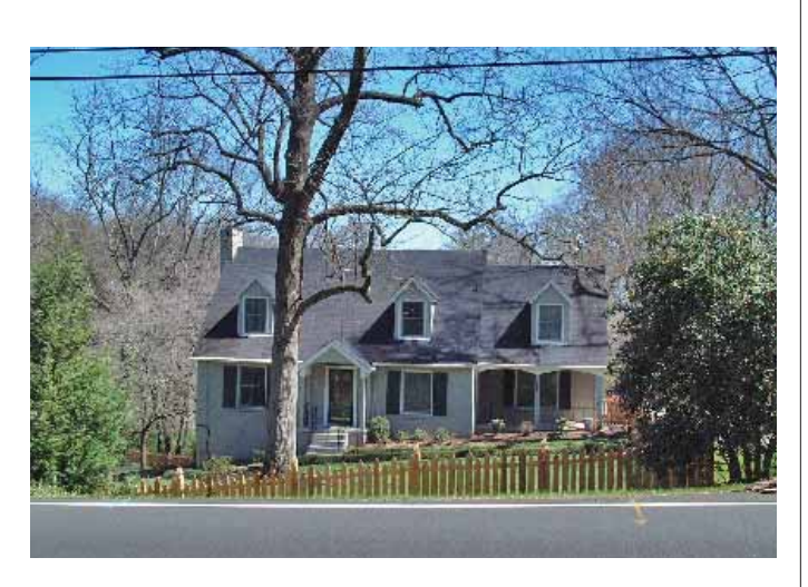
428 Scenic Drive

Neoclassical (1948). One story frame with weatherboard wall covering. Eight over eight double hung windows. Side gable roof with flanking side gabled ells. Two brick chimneys, one interior central and one exterior end. Projecting square bay on front elevation flanking front entry with entablature, both