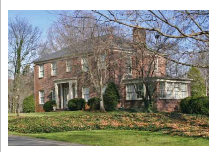
634 Scenic Drive

Neoclassical (1929). Two story frame with brick