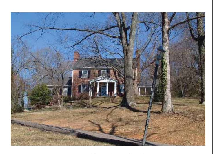
800 Blows Ferry Road

Exterior end brick chimneys. One story wings on each side elevation. Brick foundation. Rectangular plan. (C)