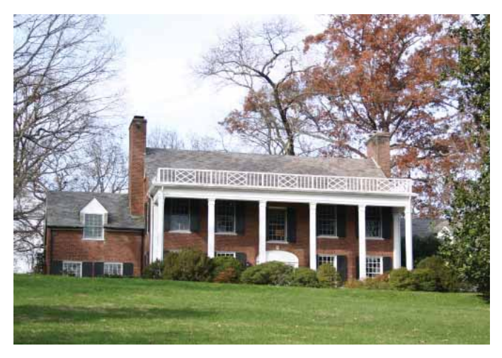
1029 Scenic Drive

Neoclassical (1931). Two story frame with brick veneer wall covering. End gable roof with slate roof covering. Six over six double hung windows. Two story front porch with two story round columns with Doric capitals, gabled roof with full entablature, dentil molding and demi-lune window. Broken pediment above front entry, flanked with half view paneled recessed sidelights; central double hung window about front entry with sidelights. Two exterior end brick chimneys. Brick foundation. Irregular plan. Architect: Baumann and Baumann. Scene of broadcast by Willard Scott as part of the NBC Today Show coverage of the