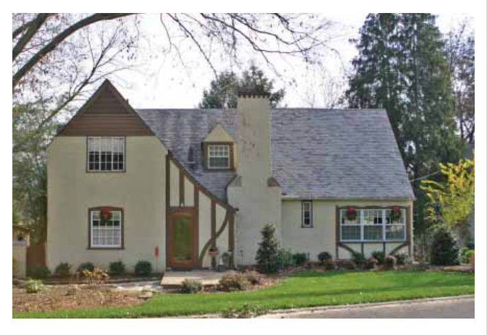
934 Scenic Drive