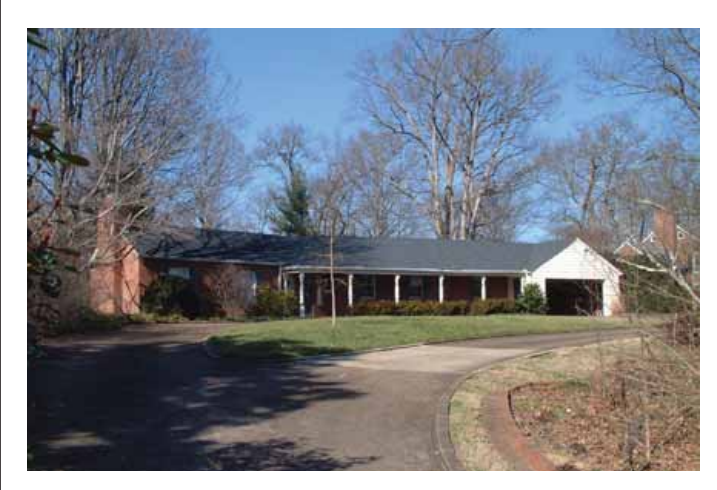
1039 Scenic Drive

The Scenic Drive Neighborhood Conservation Overlay (NC-1) area includes properties on Blows Ferry Road, Southgate Road, and Scenic Drive. The architecture on Scenic Drive ranges from the first quarter of the 20th century to present day. Forty-four properties are included in the district, with one vacant lot and seven structures that are non-contributing due to age. Significant architectural styles include Georgian Revival, Tudor Revival and, unique in Knoxville, an Art Moderne home. The street contains a Gunnison Home, a noteworthy prefabricated home