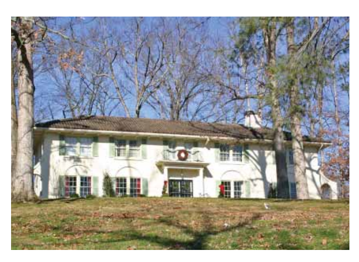
951 Scenic Drive

Ranch (1957). One story frame with brick veneer and wood wall covering. Side gable roof with asphalt