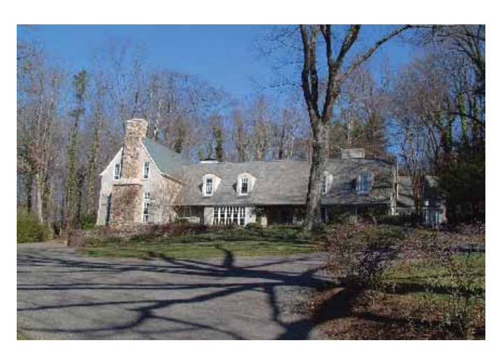
710 Blows Ferry Road

Georgian Revival. (1952). Two story frame with brick veneer wall covering. Side gable roof with asphalt shingle covering. Eight over eight double hung windows. One story, one bay front porch with gabled roof and square columns. Transom at front entry.