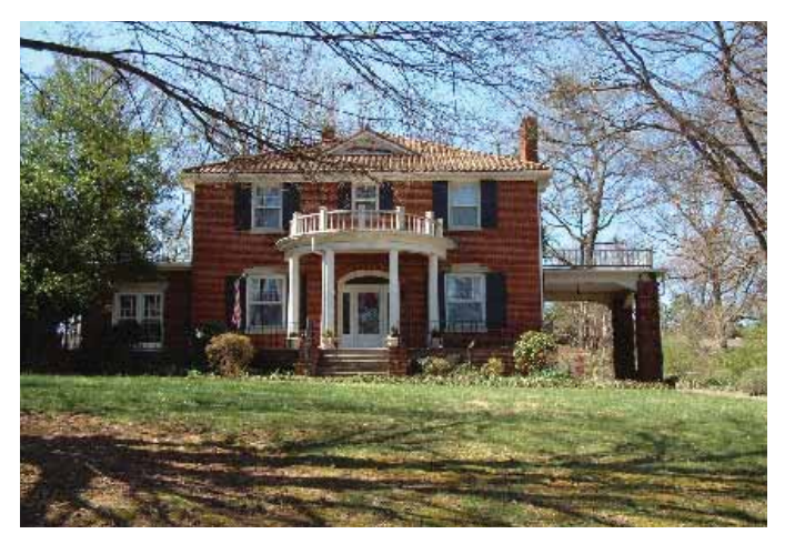
433 Scenic Drive

516 Scenic Drive (107LE00101). (2002). Tudor Revival. Two story frame with brick veneer