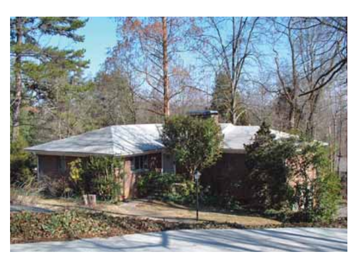
1040 Scenic Drive