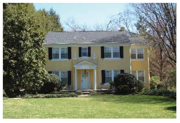
720 Scenic Drive