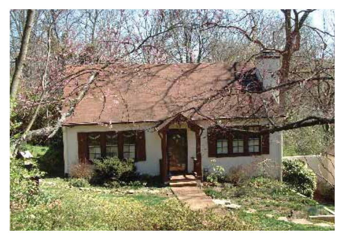
522 Scenic Drive

Tudor Revival (1929). One and one half story frame with brick veneer wall covering. Cross gable roof with gabled front dormer. Stuccoed wall covering on gabled dormer and front gable, both with applied half-timbering. Six over