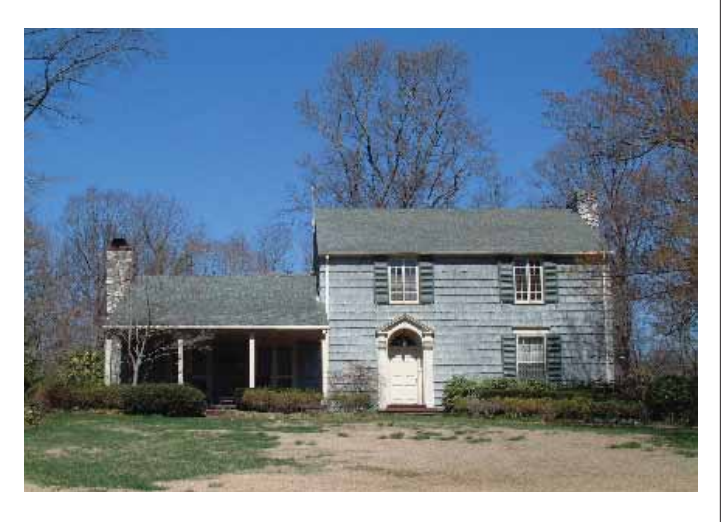
937 Scenic Drive

Neoclassical (1924). Two story frame with wood