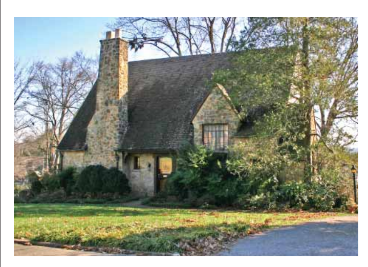
924 Scenic Drive

Tudor Revival (1924). One and one-half story frame with stone veneer of square cut, uncoursed, Ashlared stone. Cross gable roof with two gabled dormers on