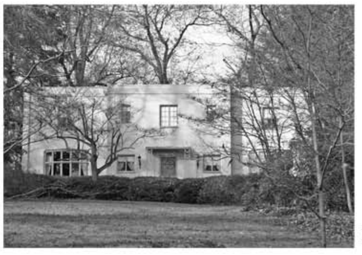
Prepared by the Knoxville-Knox County Metropolitan Planning Commission