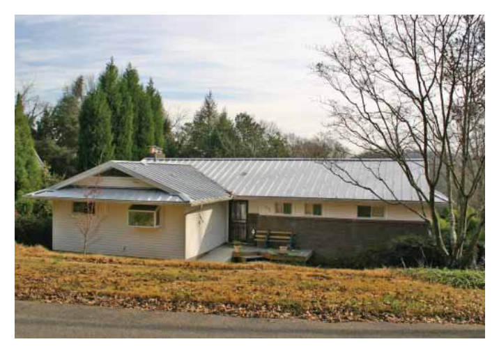
1074 Scenic Drive

five section bay windows with transoms. Facade divided into three sections with projecting central section. Concrete foundation. Irregular plan. Designed by Elizabeth W. Dunlap, a landscape architect.(C)