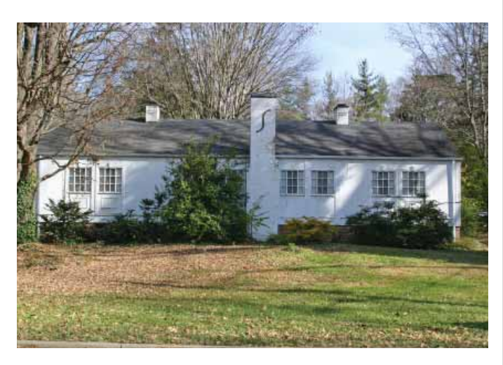
726 Scenic Drive

Neoclassical (1929). Two story frame with brick veneer wall covering. Side gable roof with two story side ell. Six over six double hung windows, paired on façade. Central entry gabled portico with partial cornice returns, round wood columns with Doric capitals, flanked by extended unroofed porches and highlighted by engaged brick piers topped by urns. Interior off center brick chimney. (C)