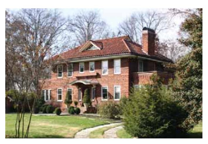
901 Scenic Drive