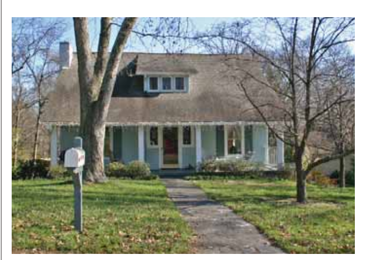
916 Southgate Drive

Contemporary (1958). One story frame with brick veneer and vertical wood siding. Side gable roof with central gable section and asphalt shingle covering. Paired double hung and casement windows. Unroofed stoop at front entry. Raised basement with enclosed garage marked by French doors to exterior. Brick foundation. Rectangular plan. (NC)